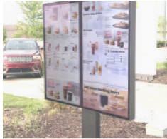
Outdoor Menu Boards

Keep operations running smoothly with a reliable vendor you can trust.