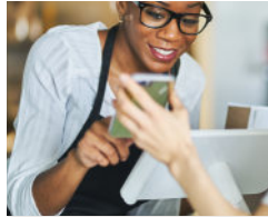
Kiosks & Tablets